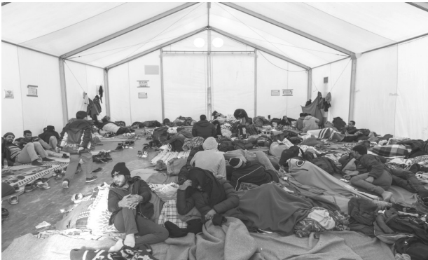
Refugees waiting to cross the border between Greece and Macedonia, November 2015

The fact is that, as of 15 March 2016, out of a proposed target of 160,000, just 937 people had been relocated. Only eighteen Member States had pledged to relocate people from Greece and nineteen Member States had pledged relocations from Italy. The total number of places formally pledged was just 3,723. 18